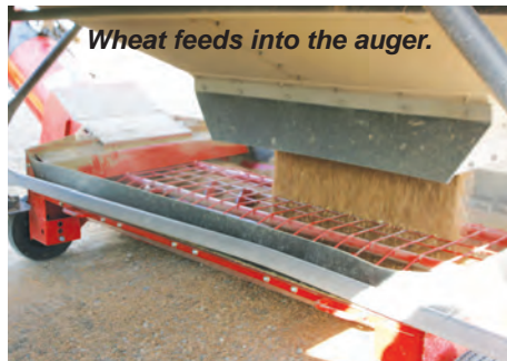
Wheat feeds into the auger.

up shortly and move back to our home base to begin spring wheat harvest in the Hoven, Bowdle and Eureka, S.D., areas. With the weather and green wheat we have encountered in South Dakota, we are getting nervous because we are getting behind. We have received word that our North Dakota jobs are getting ready, so hopefully the weather will be on our side so we can get caught up.